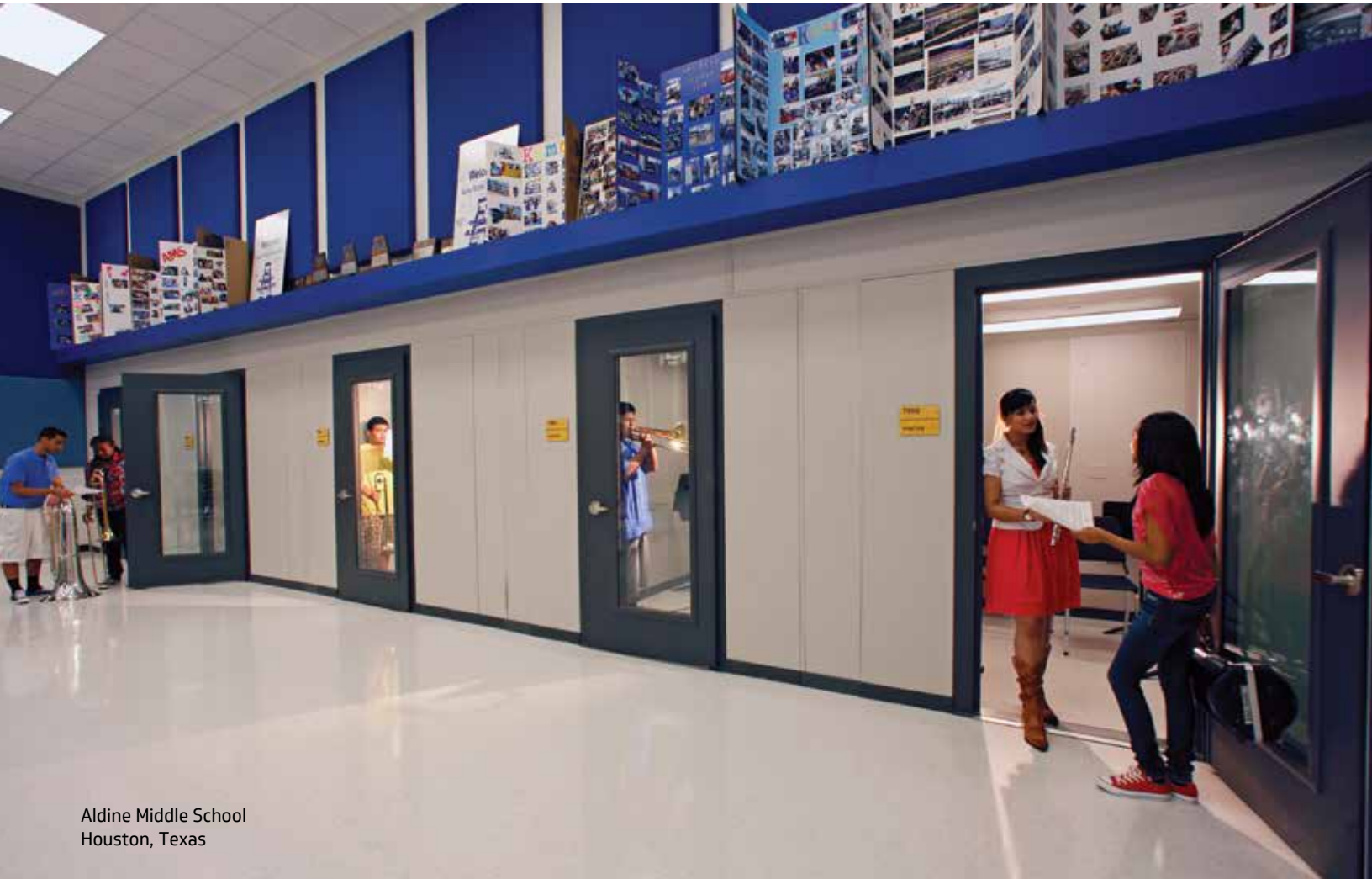
Aldine Middle School Houston, Texas