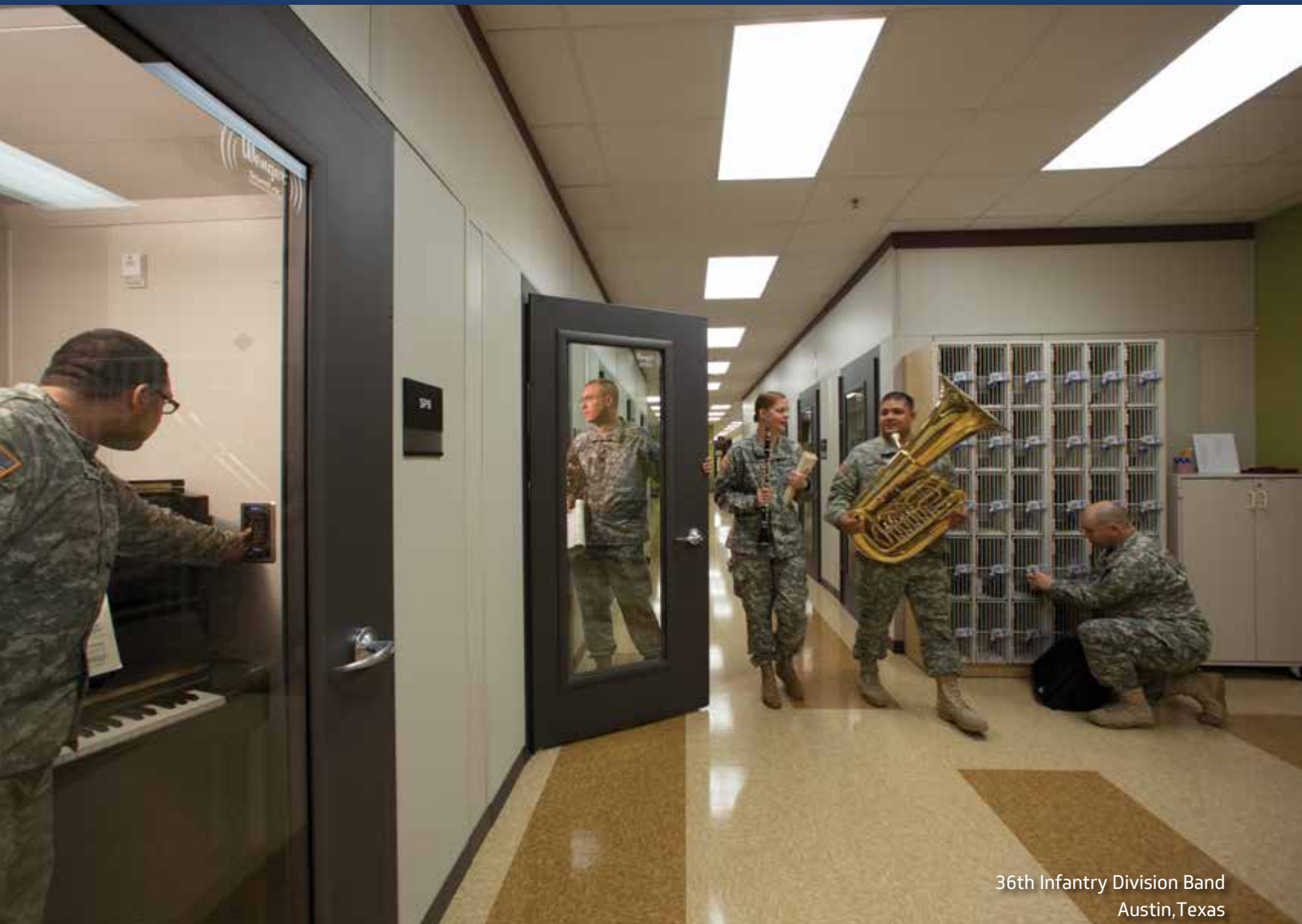
36th Infantry Division Band Austin, Texas