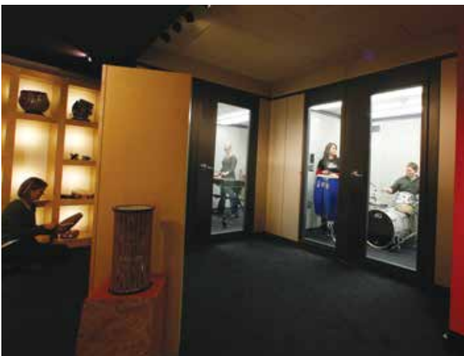
Wenger Sound-Isolation Rooms used as Museum Experience Space - Percussive Arts Society, Indianapolis, Indiana