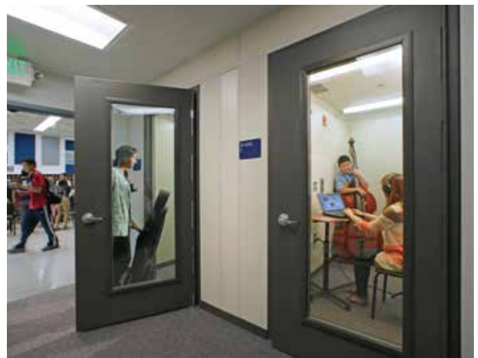
Wenger Sound-Isolation Rooms used as Music Practice Space - Walnut High School, Walnut, California