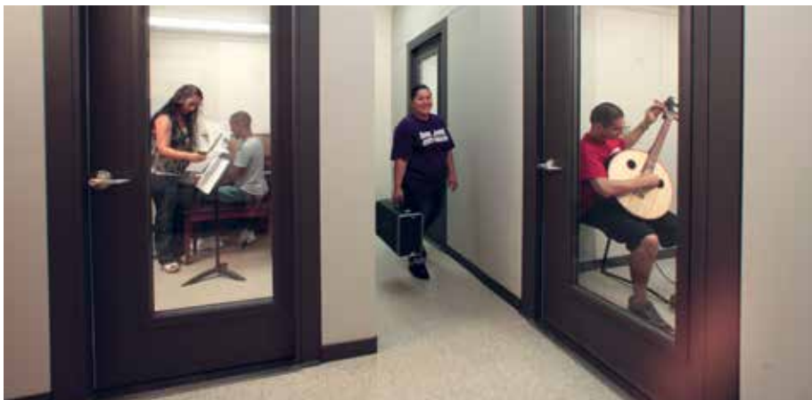
Wenger Sound-Isolation Rooms used as Music Practice Space - San Jose City College, San Jose, California

*Research shows that lie-detector tests risk false readings when not conducted in a quiet place; you can eliminate that risk and better ensure reliable polygraph results with a sound isolation room from Wenger.