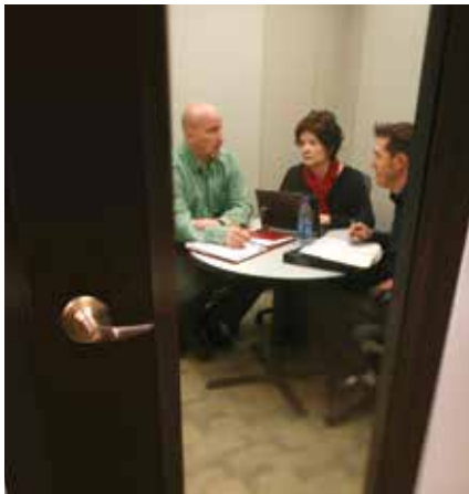
Private conference rooms

Our great breadth of sizing options allows us to tailor our sound isolation rooms to virtually any space, and our interlocking design lets us install your new room with amazing efficiency and with guaranteed sound isolation.